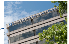
Corporate Headquarters Bala Cynwyd, Pennsylvania