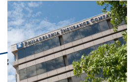
Corporate Headquarters Bala Cynwyd, Pennsylvania