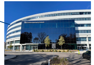
Philadelphia Insurance Companies Corporate Headquarters Bala Cynwyd, Pennsylvania